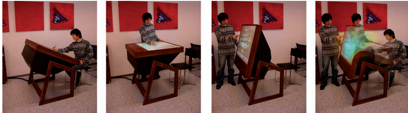
figure 1: Different setups of FLUX, as a drafting table ( left ), as a discussion table ( middle ) and as whiteboard ( right ). Context-aware applications are adapting to the current orientation.

projection. Finally, ThinSight [7] is an optical sensing system, which can be embedded behind a regular LCD panel. The retro-reflective sensor board (infrared (IR) emitters and detectors) enables to capture multi-touches as well as physical objects in front of the screen.