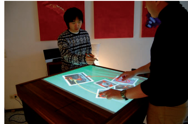
figure 2: Multiple users can interact with both pens and fingers simultaneously.

So, for example, images on the table are rotated according to the orientation of the surface. figure 1 depicts the different configurations. The left image shows a drafting table-setup for designer, the middle image shows a table-setup for discussions and the right one a whiteboard-setup for presenting the results to the audience.