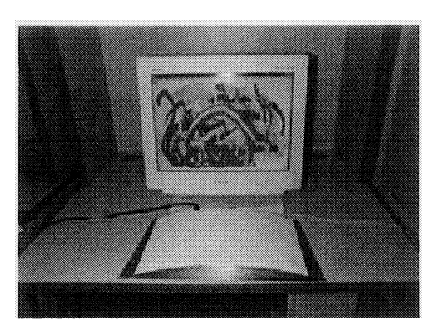
FIGURE 2: Finger-painting arrangement for children.

Westerman, W.C. and J.G. Elias (1999) "A method and apparatus for integrated manual input," U.S. Patent Application Serial No. 09/236,513, January 25.