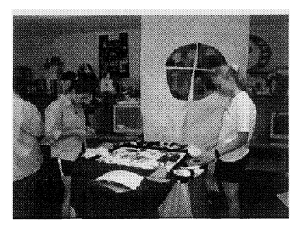
FIGURE 3: Finger painting table.

FIGURE 2: Finger-painting arrangement for children.